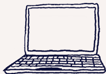
INNOVATIVE LEARNING TOOLS

WHEN YOU SPONSOR HILL ELEMENTARY, YOU DIRECTLY IMPACT OVER 900 STUDENTS THROUGH VITAL PROGRAMS, INCLUDING: