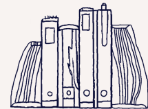
LIBRARY BOOKS & AUTHOR VISITS