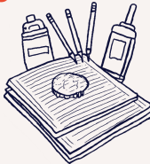
CLASSROOM SUPPLIES & PROFESSIONAL DEVELOPMENT